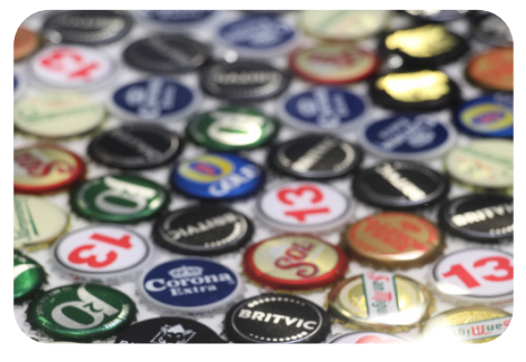
GlassCast® 3 poured over a Lego Technic Coffee Table and over a Bottle-top Bar-top.

For more information and lots of project ideas take a look at the Easy Composites product pages and Tutorials for in depth guides and case study projects.